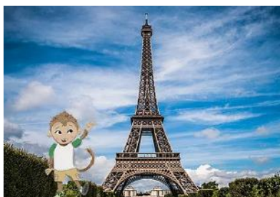
The Eiffel Tower