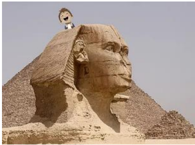
The Great Sphinx